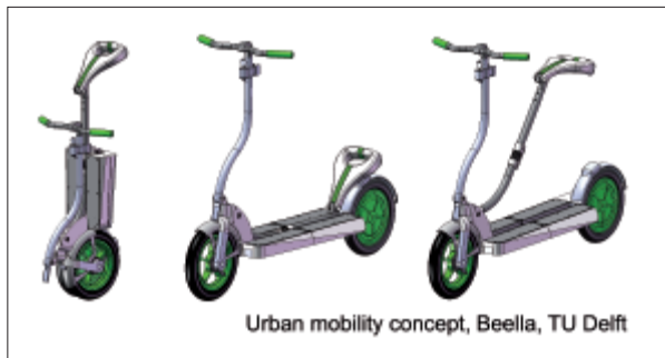
Urban mobility concept, Beella, TU Delft